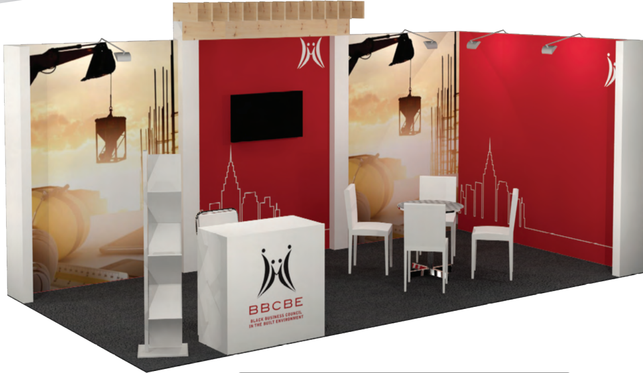
FURNITURE- OPTION 01