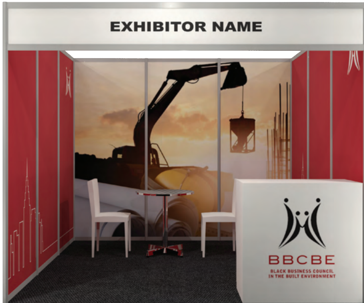
FURNITURE- OPTION 01