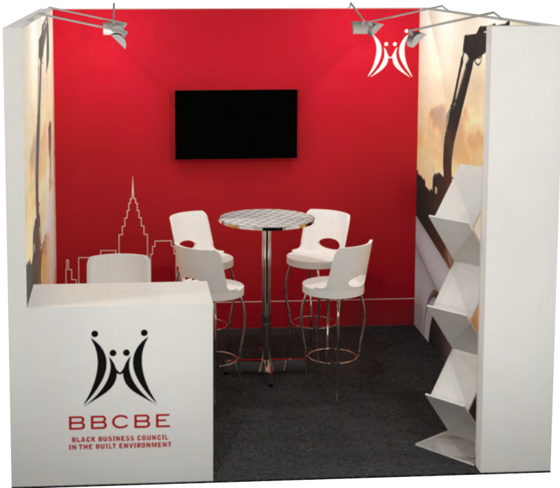
FURNITURE- OPTION 01