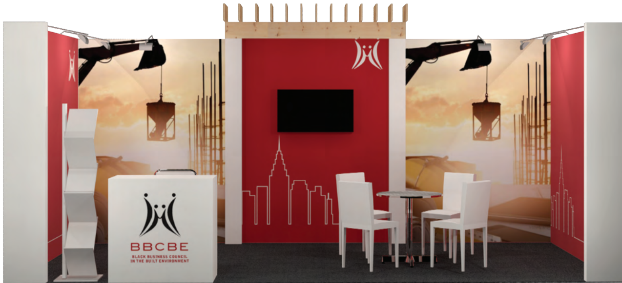
FURNITURE- OPTION 01