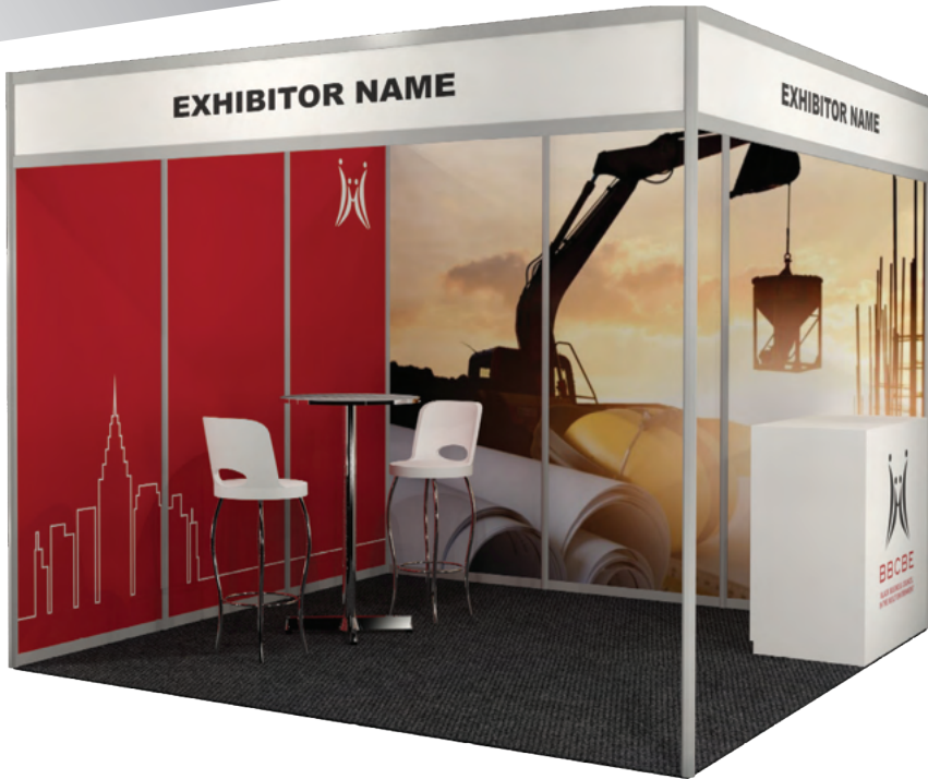
FURNITURE- OPTION 01