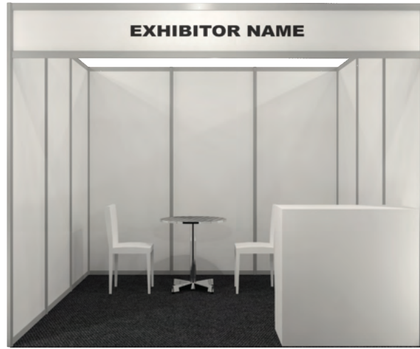
FURNITURE- OPTION 01