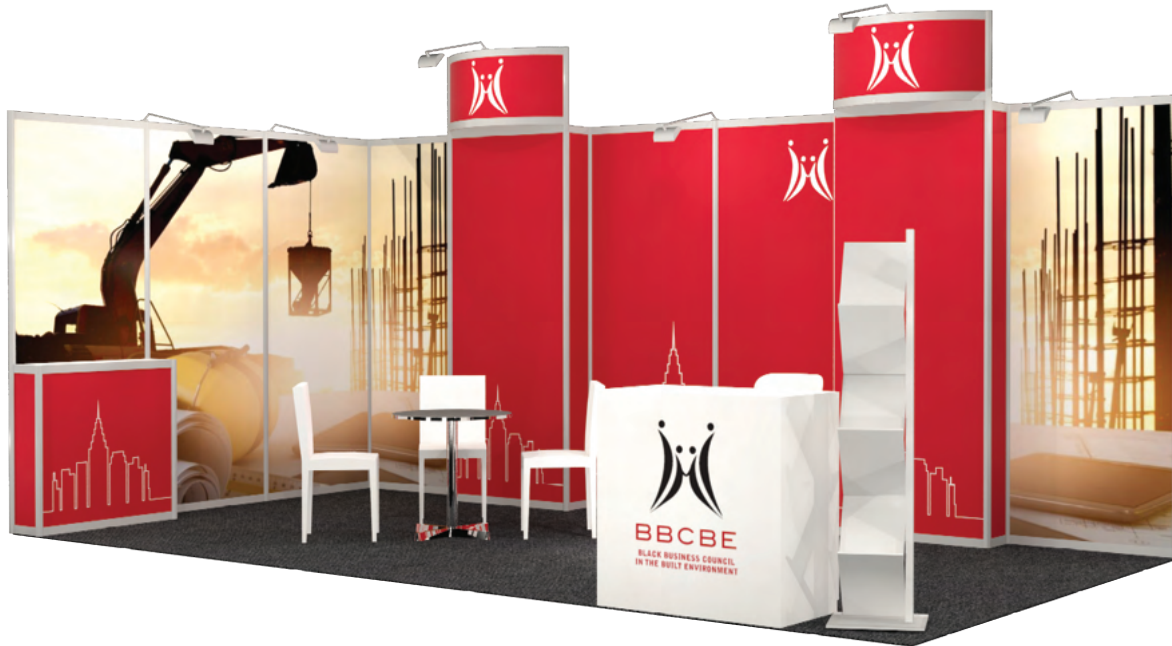
FURNITURE- OPTION 01