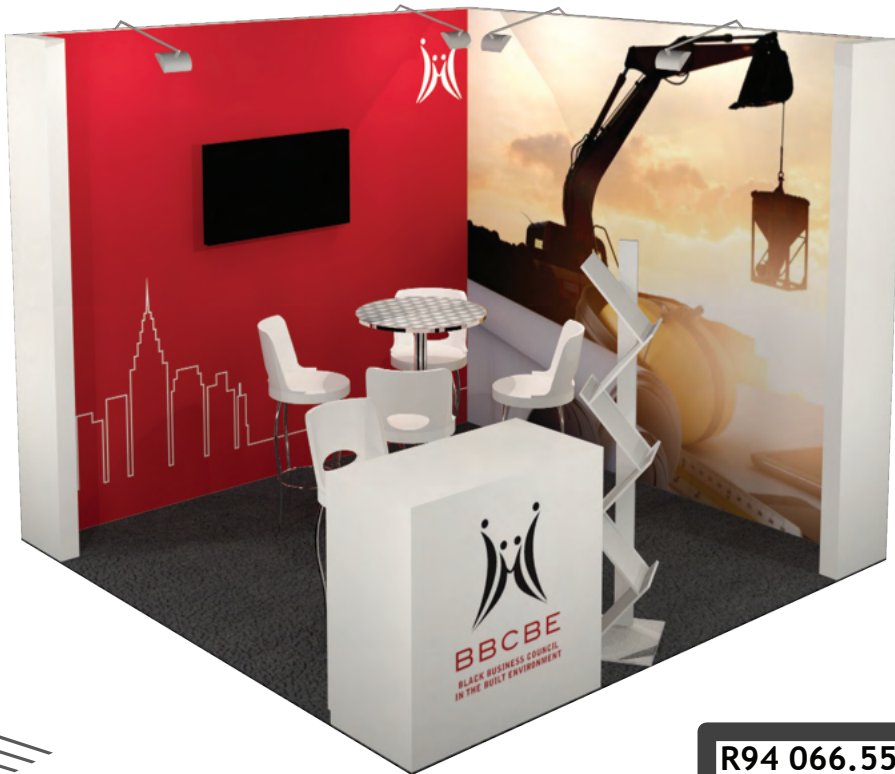
FURNITURE- OPTION 01 FURNITURE- OPTION 02