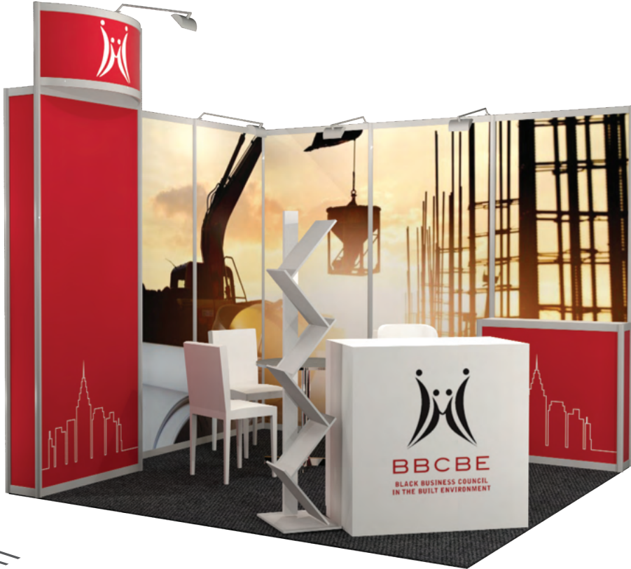
FURNITURE- OPTION 01