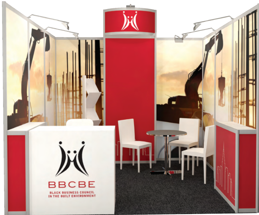
FURNITURE- OPTION 01