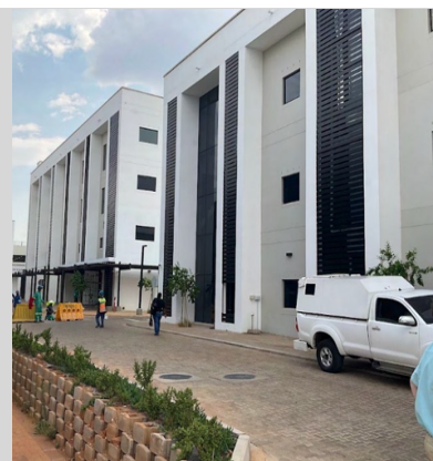
Jewelry Manufacturing Precinct constructed on behalf of the Gauteng Industrial Development Zone

The Division contributes to position DBSA as a market leader in infrastructure planning, delivery and innovative solutions that catalyse development impact. While the primary focus of the Division is to support all three spheres of government in South Africa, it also implements projects in the South African Development Community and has implemented programmes on behalf of the private sector.