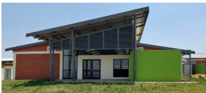
Balfour Community Health Centre constructed on behalf of National Department of Health

IDD predominantly offers end-to-end programme implementation agent services to clients. It compliments these services with programme management services which entail the provision of specialist expertise medium to long-term planning and delivery of infrastructure. Concomitantly, IDD offers capacity building services which focuses on offering innovative infrastructure learning solutions. Owing to its efficient and effective procurement track record, the division usually receives requests from government departments and state-owned entities to manage infrastructure procurement on their behalf. Consequently, it established the infrastructure procurement services capability alongside these other offerings to support clients with rapid procurement services.